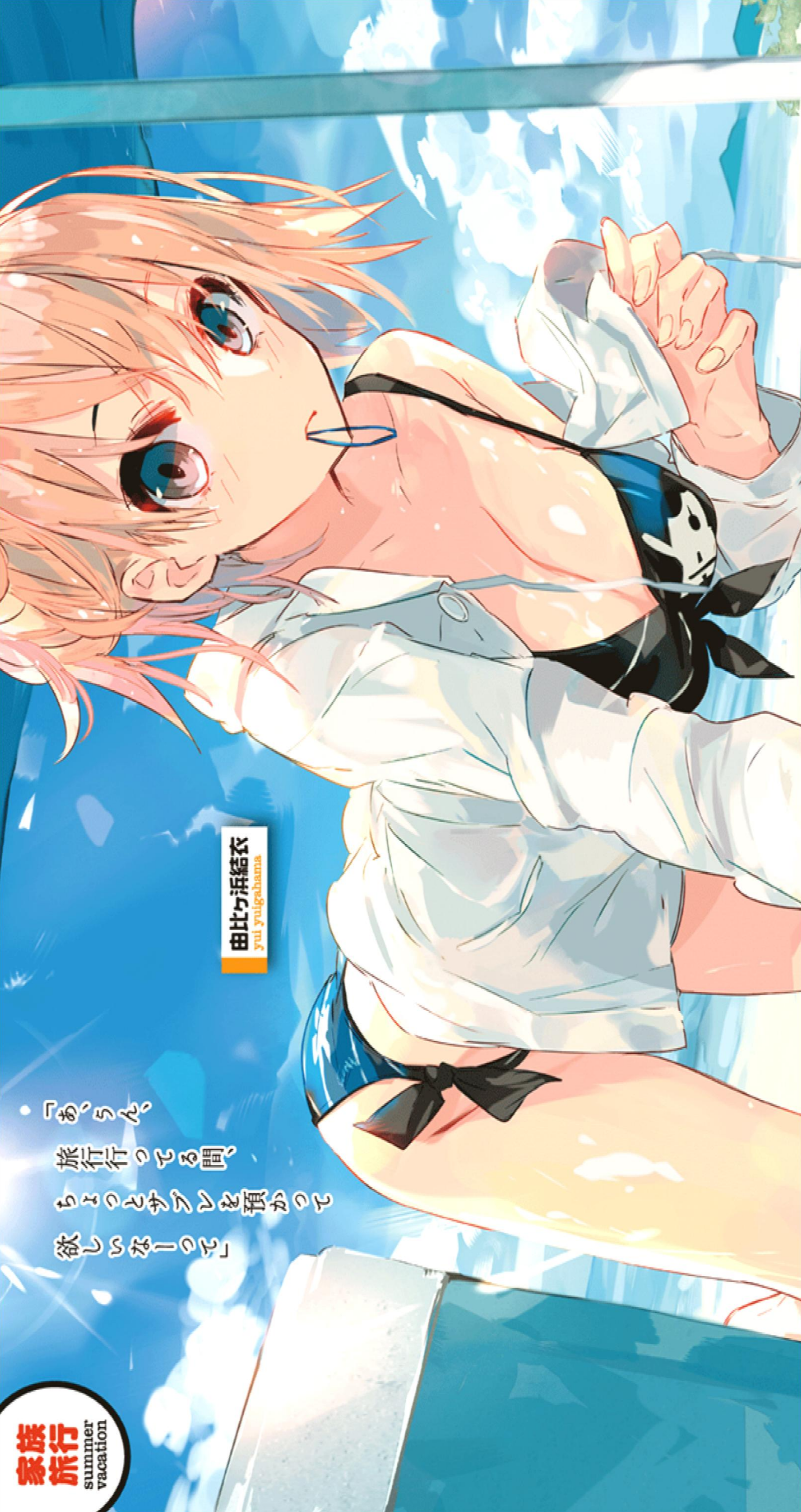
由比ヶ浜結衣 yui yuigahama